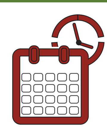
3 years from 1<sup>st</sup> July 2018 to 30<sup>th</sup> June 2021